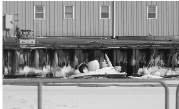
Right, partially submerged Tug Hawaii surrounded by an oil boom alongside Don Jon Shipbuilding. Top of cabin and antennas above water.

On December 31, 2025 the Great Lakes Towing Co. tug the Hawaii was moored at Holland St Pier alongside the Don Jon Shipbuilding Co. The vessel sunk (below on left) while moored there causing speculation that the high winds pounded it into the dock causing a leak and the eventual sinking.