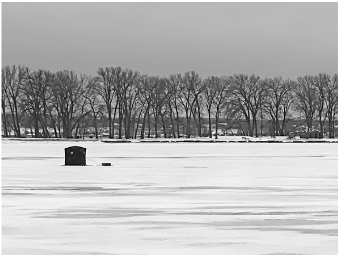
This photo of the lone hut on Misery Bay was taken on January 4th. There were six other fishermen out on Misery Bay at that time.

You name it, it happened, weather wise here in Erie early this winter. Temperatures dropped and ice formed, then it thawed, rained, and the gales hit and broke up the ice, then the ice on the bay reformed, only to be rendered unsafe by higher temperatures and more rain. Hopefully the ice will return by the time you get this newsletter. There was a brief window where a few brave souls ventured onto Horseshoe and Misery Bay.