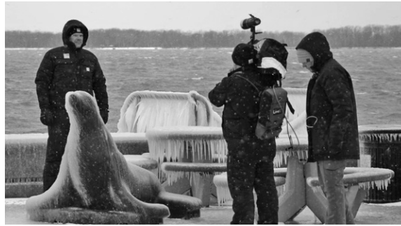
Weather Channel crew filming at Dobbins Landing.

When we published a piece about high winds creating a 'SEICHE' in late November which caused the water level on the Western end of the lake to fall and for the water in the Eastern part of the lake to rise, we didn't expect that it would happen again so soon, but it did during the last week of 2025. Sixty to seventy mph winds created another Seiche event, not only affecting the water levels but causing havoc along our shores. The high winds blew away the ice cover in the bay. The spray created by the winds and waves created ice sculptures along our waterfront. The event attracted National attention. The Weather Channel sent a crew to Erie to cover the storm.