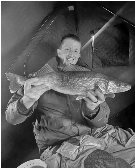
by Dirty 30 Charters