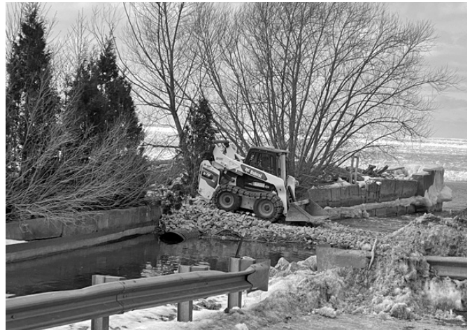
Gravel bridge across stream notice culvert