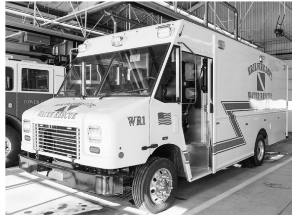
New EFD Dive Team Truck

The City of Erie Fire Department just purchased a brand-new unit for their Water Rescue Team. thanks to a generous grant of $142,234 from the Commonwealth Financing Authority. We have been advocates of this team since its inception in the late 1990's. We began our support by purchasing and donating the team's first vehicle a used aluminum body step van from Stroehman bakeries for their equipment and use. It was still in operation until it was replaced this year. We also supported the team by donating diving gear. In 2019 we donated $5500 to cover the 2019 training new divers and the cost of 3 rescue suits. In 2021 the SONS continued the support by donating $2000 to train 7 new divers. These brave first responders need all the help we can give.