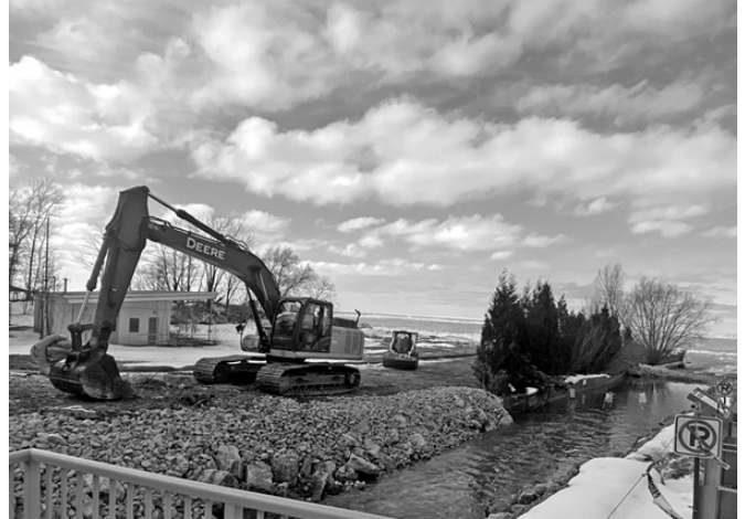
Excavator working at Trout Run

Recently the west wall of the Trout Run Stream bed collapsed about 100 yards upstream from its mouth. In early February workers from the PFBC were at work replacing it with a rip rap wall. The cleverly constructed a gravel bridge across the stream with a 4ft culvert built in to allow the water to continue flowing to the lake. They used the bridge to transfer the stone which was unloaded on the beach on the east side. An excavator was at work on the west side reinforcing the bank with the stone.