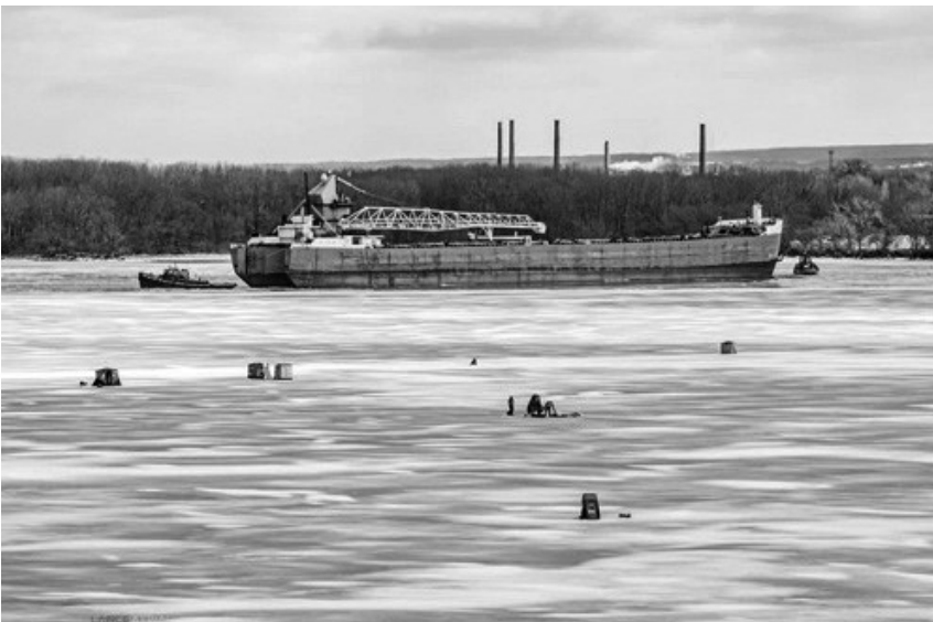
Tug boats moving a large vessel for Don Jon Shipbuilding on PI Bay while ice fishermen are enjoying the sport about half mile away.