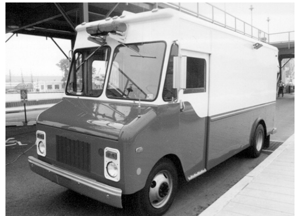
Box truck donated to the EFD dive team in the '90's