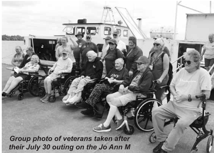
Group photo of veterans taken after their July 30 outing on the Jo Ann M