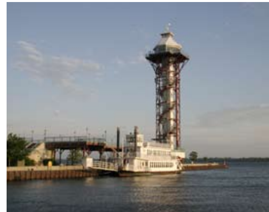
The Bicentennial tower on Presque Isle Bay

Visit the S.O.N.S Tower Camera at our web site sonsoflakeerie.org . Learn more about what we do and check out our web cam which is located on top of the Bicentennial Tower located on Dobbins Landing on Presque Isle Bay. The camera provides a beautiful view of the bay and surrounding area. There are detailed instructions on how to access and operate this web camera.