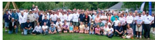
Each year the S.O.N.S. of Lake Erie volunteers are invited to a picnic for a little fun and friendship.

Volunteers are the key to the success of any service organization. The S.O.N.S. of Lake Erie is blessed with a group of individuals who donate their time and resources generously to the activities of the club. They willingly roll up their sleeves and tackle any challenge put before them. What a great bunch!