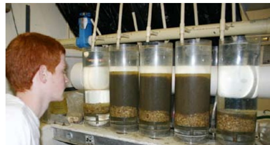
A young visitor studies the Walleye Eggs in the hatching jars at the S.O.N.S. hatchery

Millions of Walleye, Yellow Perch, Brown Trout, and Steelhead have been produced in the S.O.N.S. hatchery since 1985.