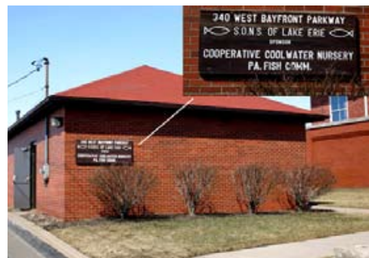
The S.O.N.S. of Lake Erie Fish Hatchery is located at the foot of Chestnut Street in Erie, PA

Built in 1985 with money raised by a grant from the Pennsylvania State Legislature to the Erie Western Pennsylvania Port Authority, the S.O.N.S. were designated as the operators of the facility under the auspices of the Pennsylvania Fish and Boat Commission.