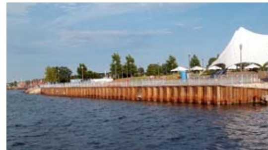
Liberty Pier fishing access area as seen from the water