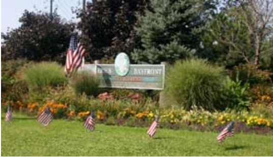
East entrance to Erie's Bayfront Park