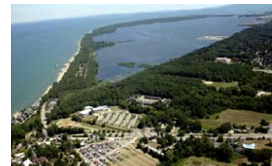
Public access to the waters adjacent to Presque Isle Bay has been assured due to the cooperation of the S.O.N.S. of Lake Erie, Port Authority, and Convention Center Authorities, as well as private developers.

Public Access is absolutely the most important factor to a successful fishery. The S.O.N.S. of Lake Erie has been the champions of public access. Today a great portion of the land bordering Presque Isle Bay in Erie is open to the public to enjoy fishing, walking and just experiencing the magnificent view.