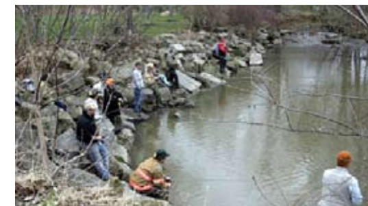
Cascade Creek on the 1st day of Trout Season

Adopt-A-Stream is a program developed by the Pennsylvania Fish and Boat Commission to allow groups and individuals to help improve habitat and water quality in Pennsylvania streams. The S.O.N.S. of Lake Erie joined the program over 25 years ago by adopting Cascade Creek which runs through the City of Erie. Years of work has produced great success. The once polluted stream is now stocked with Trout each year affording the opportunity for fishing to inner city youths.