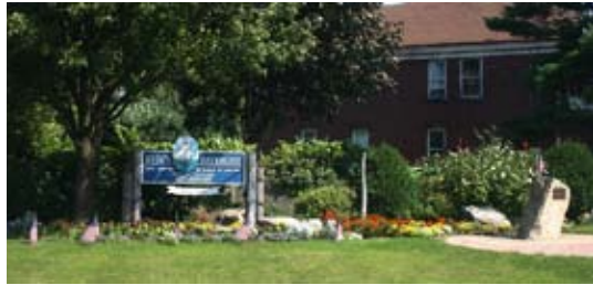
West entrance to Erie's Bayfront Park

The S.O.N.S. have adopted two parks on the East and West ends of the Bayfront Parkway, offering visitors a pleasant welcome to Erie's waterfront. S.O.N.S. maintains these beautiful places.