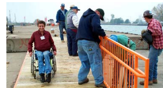
S.O.N.S. volunteers put the finishing touches on a handicapped accessible ramp on the South pier just in time for its first user.

Handicapped accessible fishing opportunities have been provided for our less fortunate neighbors at the North and South Piers at the entrance to Presque Isle Bay by the S.O.N.S. of Lake Erie.