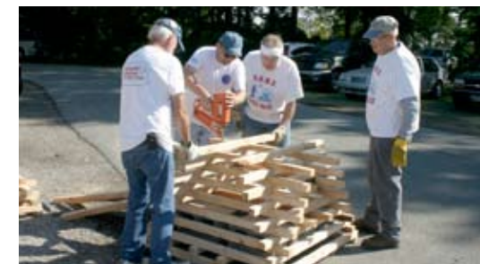
S.O.N.S. volunteers building fish habitat structures

Building fish habitat structures was an early S.O.N.S. project. In cooperation with the PA Fish & Boat Commission S.O.N.S. volunteers constructed over 200 fish habitat structures and placed them in Presque Isle Bay.