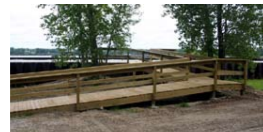
Handicapped access ramp North Pier