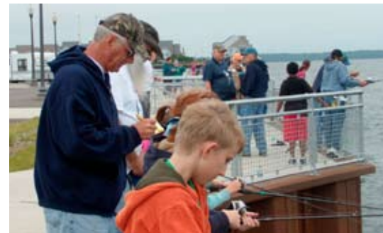
S.O.N.S. volunteers teach kids to fish at the Liberty Pier fishing access area.