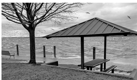
Illustration shows how the water in Lake Erie fell on its west end and went up on the east end. Other reports tell about the lake bottom that was exposed by the water drop revealed some normally hidden objects. In Avon Ohio beach combers were digging up beach glass.

In Kingsville, Ontario the receding water revealed a shipwreck. In Erie the water level rose and flooded the top of the South Pier as shown in this photo posted on Facebook by Joe Kempisty.