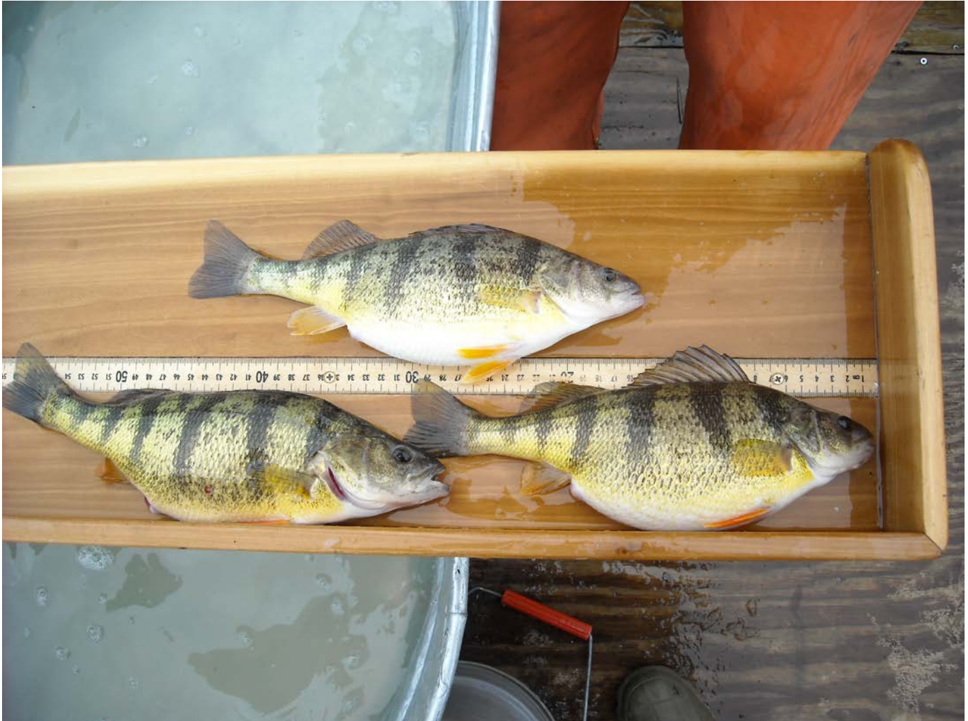
Some nice yellow perch ready to spawn in Presque Isle Bay.

Presque Isle Bay is a 3,300 acre embayment of Lake Erie formed by a 7 mile long peninsula. The peninsula that forms Presque Isle Bay is contained within Presque Isle State Park which is operated by the Pennsylvania Department of Natural Resources (PA DCNR). There are 4 boat launch areas located in the Park. There is no limitation on boat horsepower, however, many areas of the Bay are designated as no-wake zones. For more information on recreational opportunities in Presque Isle State Park visit the PA DCNR website at http://www.dcnr.state.pa.us/stateparks/findapark/presqueisle/index.htm .